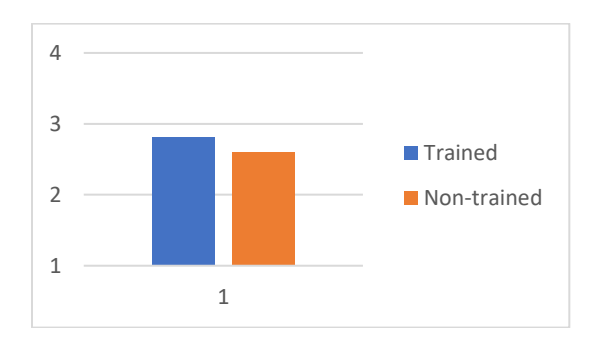
Figure 1.0. General Satisfaction with Super Minds 2

Generally, teachers were not completely satisfied with the prescribed teaching material. They considered the textbook acceptable, giving an average of 2.7 points on a 4-point Likert scale (1-very poor; 2- poor; 3- good; 4- very good). Interestingly, there was a slight difference between trained and non-trained language teachers' views as shown in Figure 1: