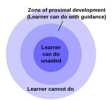
Figure 2. Zone of Proximal Development

Scaffolding is modifying the guidance level to fit the children's cognitive potential as well as performance over the course of a teaching session. If a young learner is striving in the given task, more support is provided until over time, the child will need less support as they show improvements in the given task. Apparently, scaffolding preserves the level of the young learner's possible development within the ZPD. In addition, the important element in the ZPD as well as scaffolding is, the language achievement. The following diagram is created by Vygotsky to explain about the Zone of Proximal Development in the scaffolding theory.