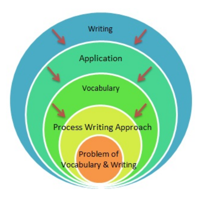
Figure 3. The Scaffolding Theory in the VAW Method

The following diagram is created by the author to introduce the preliminary method of VAW which is also created by the author.