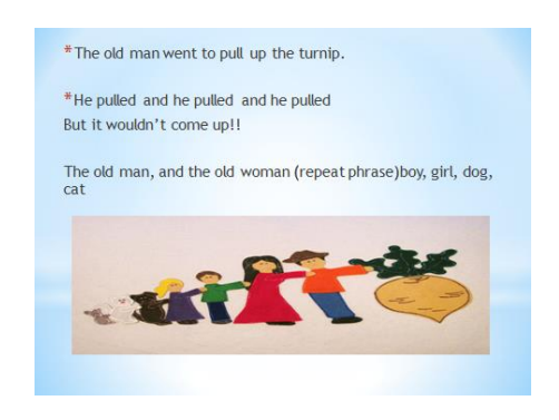
Figure 1. The Enormous Turnip story and scavenger hunt

sparked the qualitative discussion as to what constitutes literacy practices. Figure 1 shows the story pictures for the Enormous Turnip (designed by Boivin, 2013).