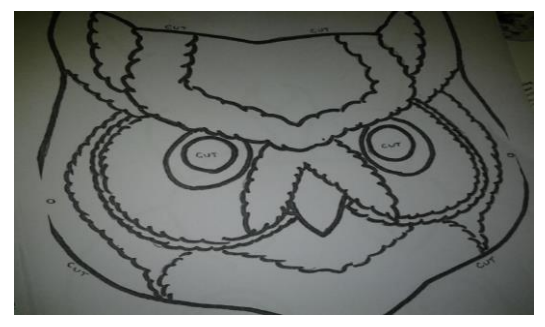
Figure 3a. Owl mask from the Gruffalo

In activity 3, the Gruffalo movie was shown. This activity took the storybook and connected it to multiliteracy of a short video. Meaning of the vocabulary was provided through visual cues and the 3D action in the movie. Next, the students created masks depicting the characters in the movie. The masks allowed the children to create applied versions of the vocabulary. Then, using colour pencils and crayons the teachers reviewed colour and animal vocabulary. The children were encouraged to ask for crayon colours in English asking "Excuse me, do you have a red... Do you have scissors?" Parents were directed to free online resources. Figures 3a, 3b, 3c, and 3d are the Gruffalo character masks used after the movie.