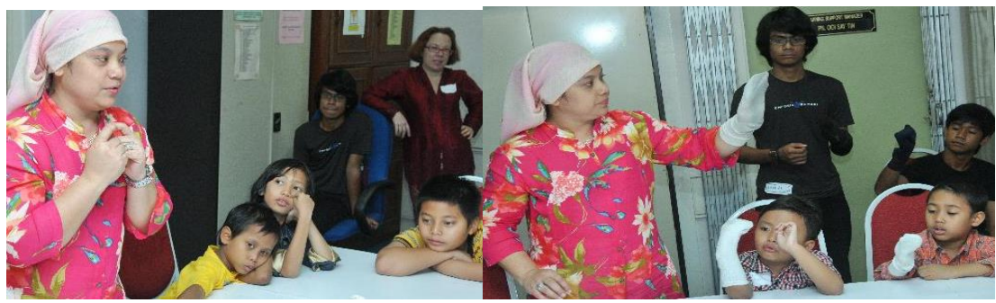
Figure 4a. "Where do the eyes go?"