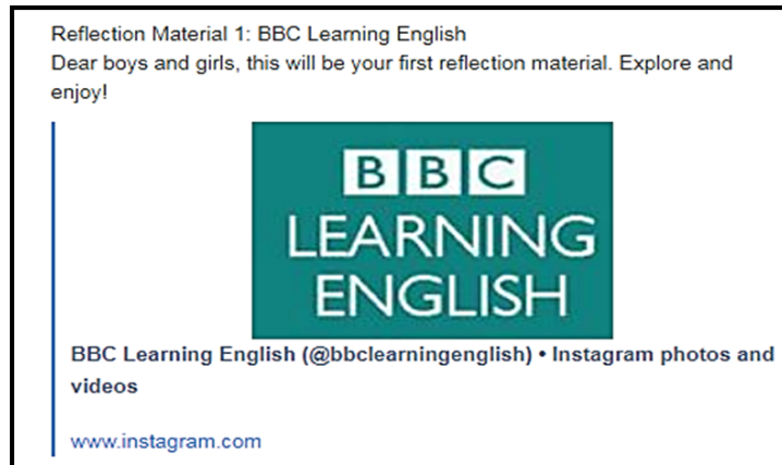
Figure 1. Screenshot of the reflection material from Instagram, posted on Edmodo