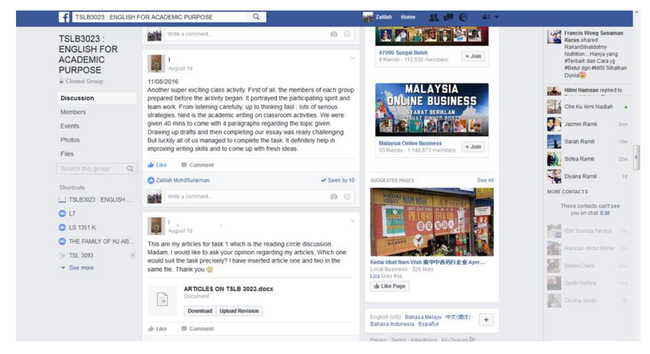
Figure 2. Snapshot of the teaching and learning activites in the Facebook environment

All the participants were fully informed of the aims of the study. In order to maintain confidentiality, pseudonymns were given to the participants. In the first week the instructors designed a task within their syllabus to teach the pre-service teachers in the online environment. They were also given the freedom to decide on the instructional method, subject matter and learning objective of the final project and come up with a complete lesson plan. Instructors were also encouraged to use Facebook by the researcher but again they were also given the freedom to choose other platforms. Making the Facebook as optional to the instructors was essential to verify their interest of employing Facebook as an educational platform.